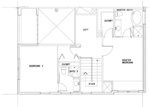
2nd Floor - Typical Unit

Units A&F - 1495 s.f. Units B,C,D,E - 1700 s.f.